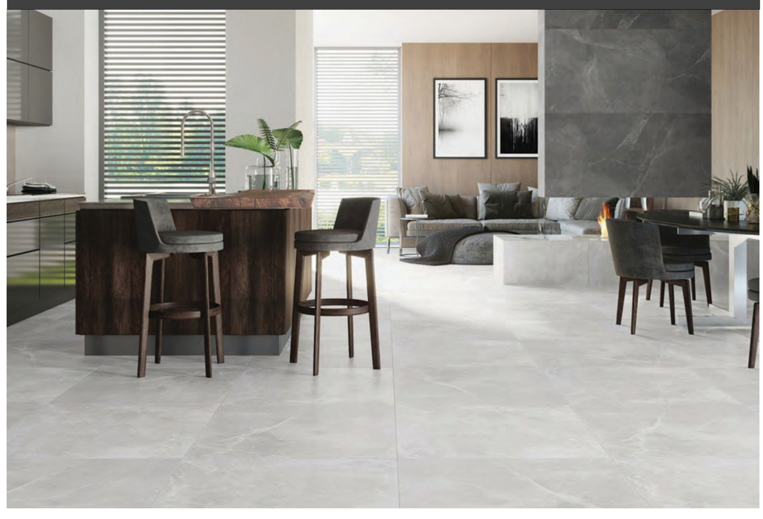
STONEMOOD Porcelain Series